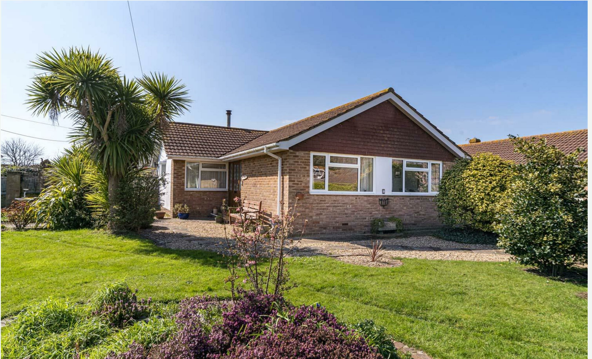
1 Howgate Close, Bembridge, Isle of Wight, PO35 5TG